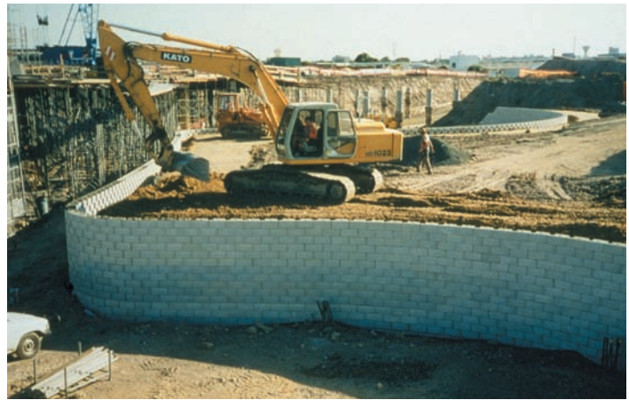
Keystone offers durable structure with flexible design capabilities

Midway through the stadium construction, Multiplex was faced with the problem of installing utility services through the walls and the pile casings required for the stadium structure. Openings (ducts) were installed through the walls to accommodate the services once the wall was complete. During construction of the retaining wall, pile casings were built, making it possible for the contractors to finalize the piles soon after the walls completion. To assure Multiplex