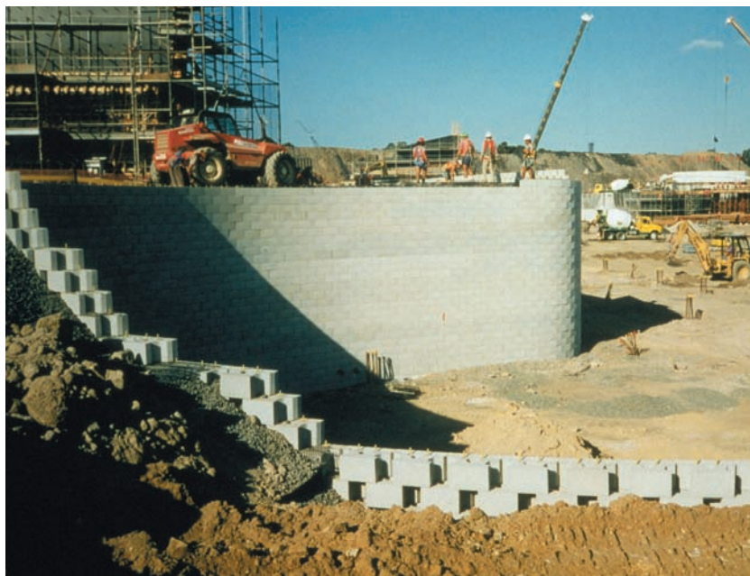
High quality results using smooth texture Keystone units and multiple radii layout.