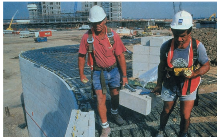
Construction continues with Keystone and geogrid

that the structural integrity of the wall would not be compromised, tests were conducted on a specially constructed sample wall. The tests illustrated that only in sections where utilities ran very close to the wall were expensive ducting solutions required.